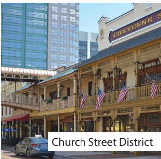
Church Street District