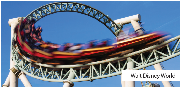
Walt Disney World