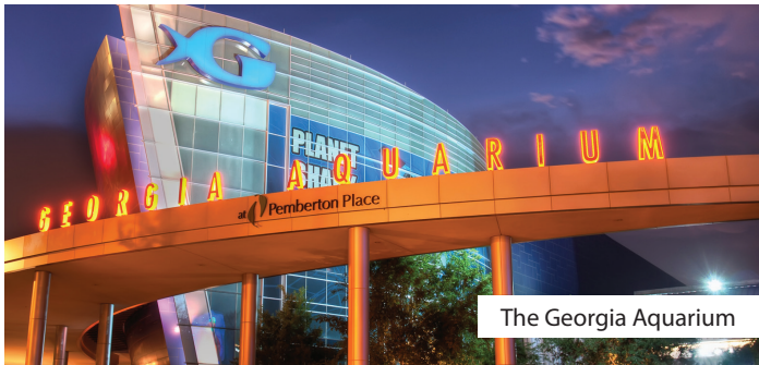
The Georgia Aquarium