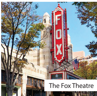
The Fox Theatre