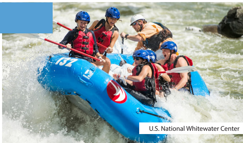
U.S. National Whitewater Center

Sophisticated culture, historical attractions and outdoor adventures. It's your move.