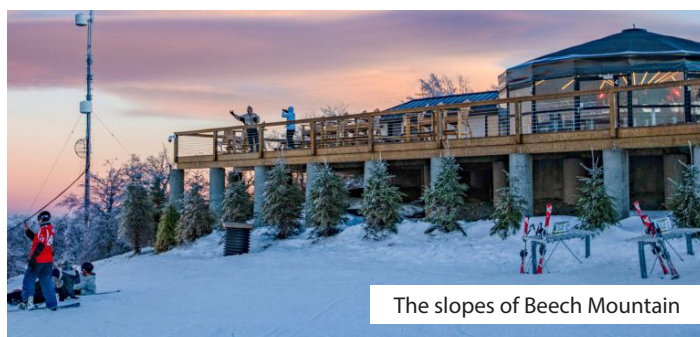
The slopes of Beech Mountain