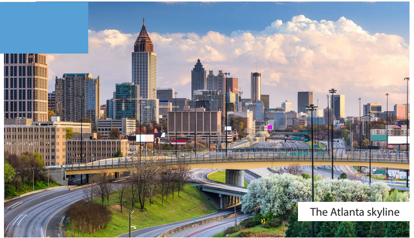
The Atlanta skyline

World-class entertainment, fine dining, upscale shopping and seasonal beauty. It's your move.