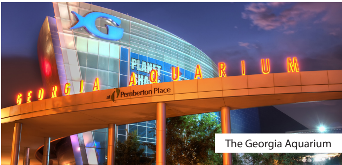
The Georgia Aquarium