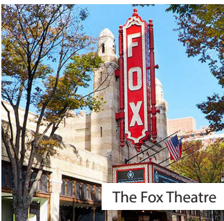
The Fox Theatre