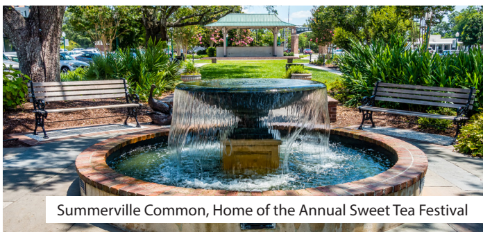
Summerville Common, Home of the Annual Sweet Tea Festival