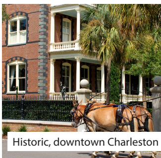
Historic, downtown Charleston