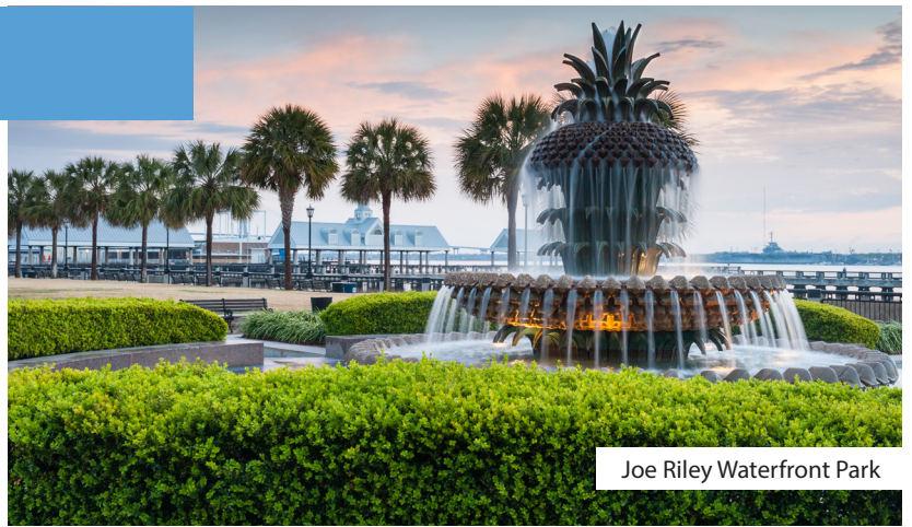
Joe Riley Waterfront Park

Charleston's warm summers and mild winters are perfect for adventuring outdoors and exploring all the historical sites the area has to offer. Enjoy the small-town charm of Summerville, the birthplace of Sweet Tea, and its close proximity to vibrant and historic downtown Charleston. With beautiful beaches and world-class dining, come experience Charleston for yourself and see why it has been named #1 on Travel + Leisure's "World's Best Cities" list.