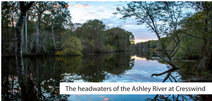
The headwaters of the Ashley River at Cresswind