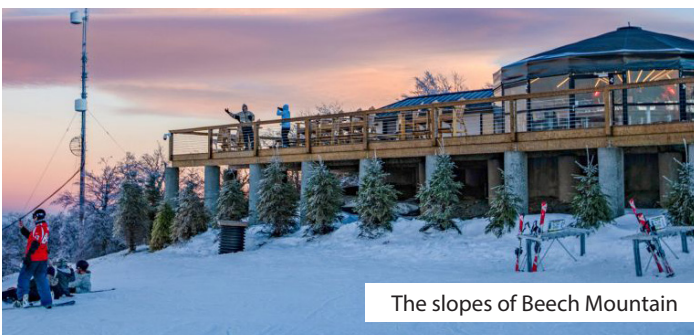
The slopes of Beech Mountain