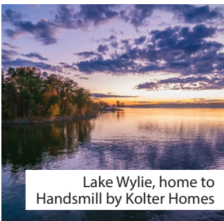
Lake Wylie, home to Handsmill by Kolter Homes