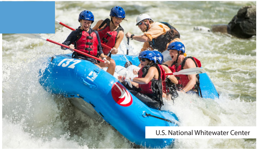
U.S. National Whitewater Center

Sophisticated culture, historical attractions and outdoor adventures. It's your move.