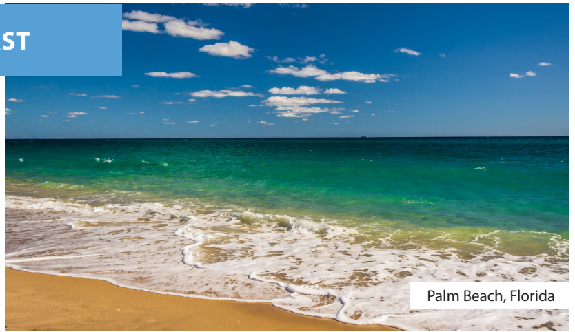
Palm Beach, Florida

South Florida excitement, coastal charm, beautiful beaches and lively attractions are waiting. It's your move.