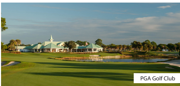
PGA Golf Club