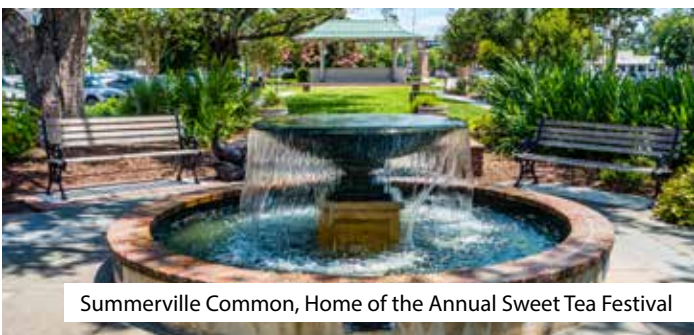
Summerville Common, Home of the Annual Sweet Tea Festival