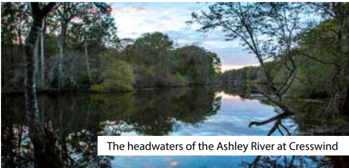
The headwaters of the Ashley River at Cresswind