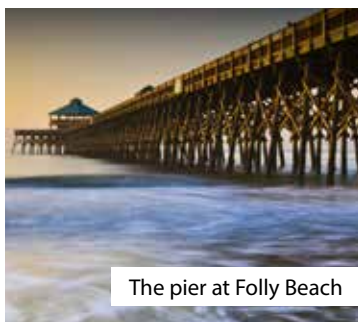
The pier at Folly Beach