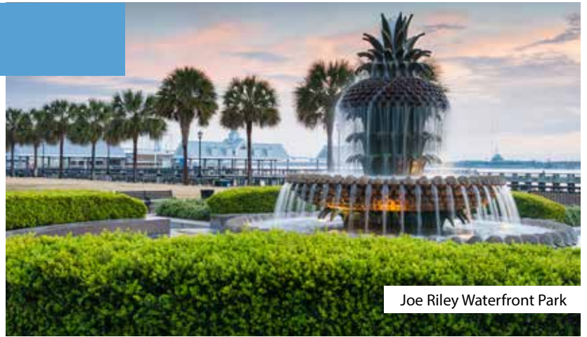
Joe Riley Waterfront Park

Year-round beachgoing, nature to explore and history to discover all await. It's your move.