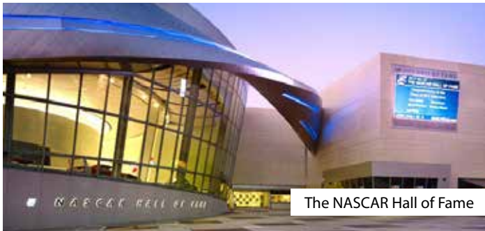
The NASCAR Hall of Fame