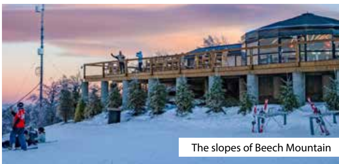
The slopes of Beech Mountain