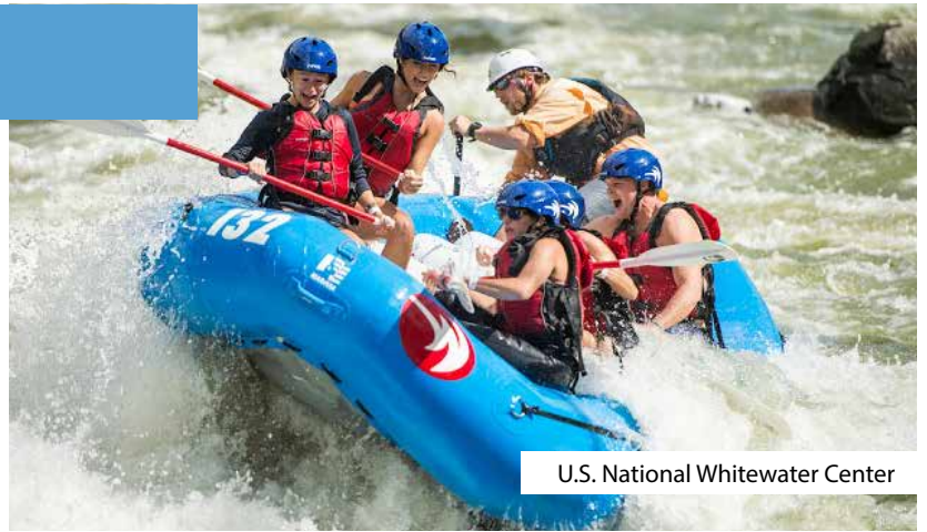
U.S. National Whitewater Center

Sophisticated culture, historical attractions and outdoor adventures. It's your move.